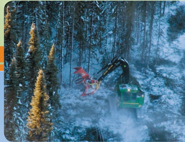
A tree feller clears the bushline for the access road.

THE PROJECT EMPLOYED MORE THAN 250 WORKERS AT FISCAL YEAR END, 75% OF WHOM ARE ABORIGINAL.