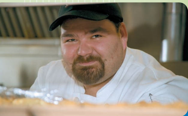
Catering employee prepares food for 150 workers at the Wuskwatim access road construction camp.