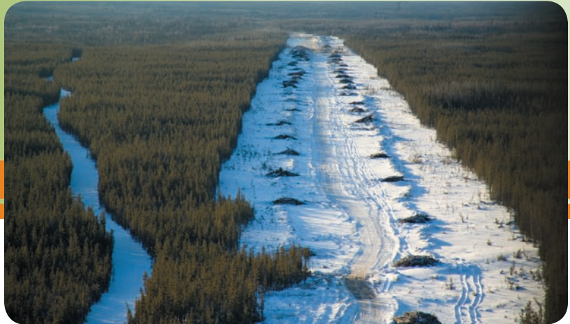
Construction of the 48-kilometre access road began in August 2006 and continued through the winter.