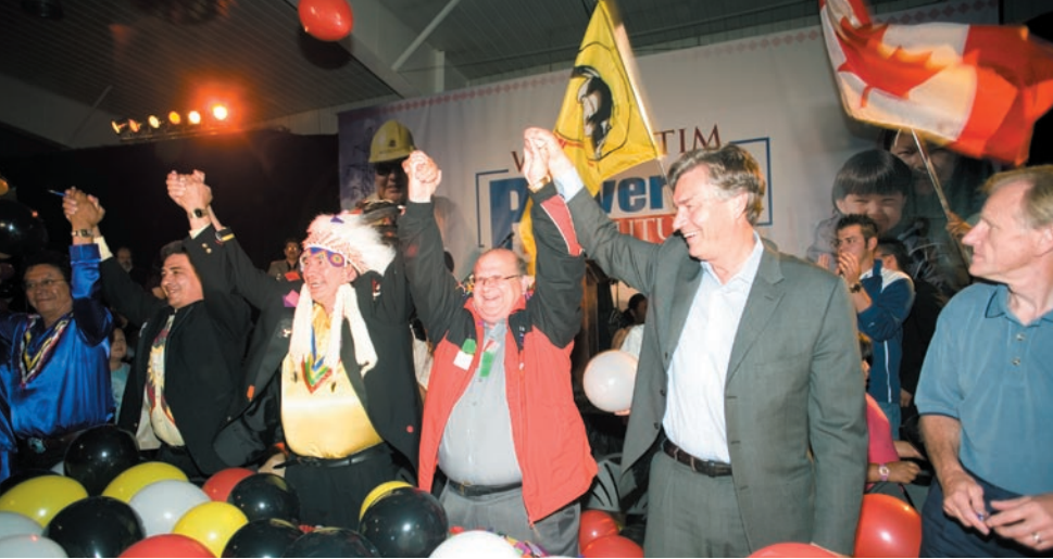
NCN's Chief and Council and Senior Manitoba Hydro officials, along with Premier Gary Doer, celebrate the signing of the PDA at a historic and cultural ceremony held in Nelson House, June 2006.

representatives and many community members attended the ceremony.