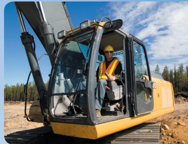
Heavy equipment operator at work on the project.