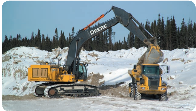
Heavy equipment operators work to schedule on the all-weather access road leading to the Wuskwatim site.