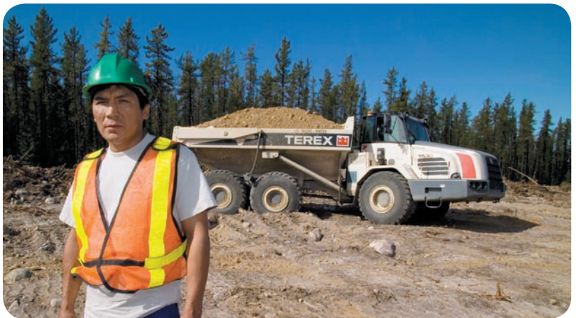
Rock truck hauling construction materials on the Wuskwatim access road.