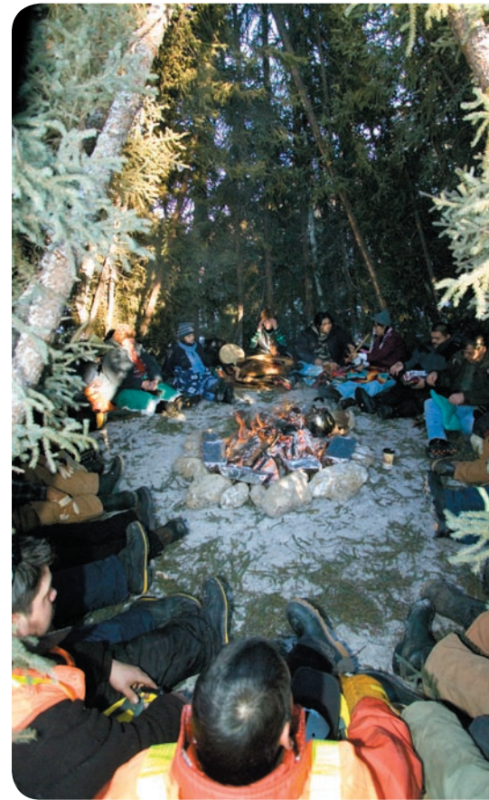
NCN cultural leaders and members, along with Manitoba Hydro personnel and contractors, participate in a stream-crossing ceremony during winter construction of the access road.

In August 2006, a ceremony was held at the Manitoba Legislature to sign the Wuskwatim Heritage Resources Memorandum of Agreement. This precedent setting agreement, signed by NCN, WPLP and the Government of Manitoba, recognizes that all the parties have an interest in protecting and co-managing heritage resources discovered during construction of the project. The signing of the Heritage Resources Agreement was the final step necessary before construction could begin.