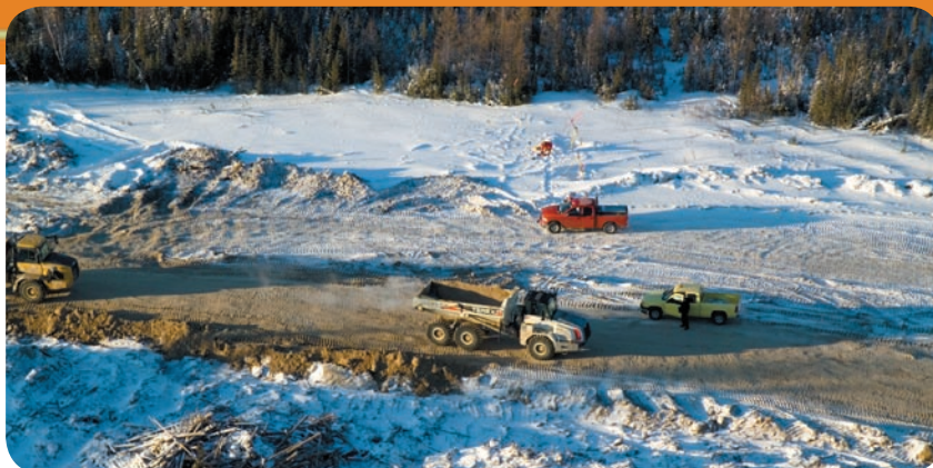
Aerial photo of access road construction.

VARIOUS CULTURAL AWARENESS AND RETENTION SUPPORT PROGRAMS ARE AIMED AT KEEPING NORTHERN AND ABORIGINAL WORKERS EMPLOYED ON THE PROJECT.