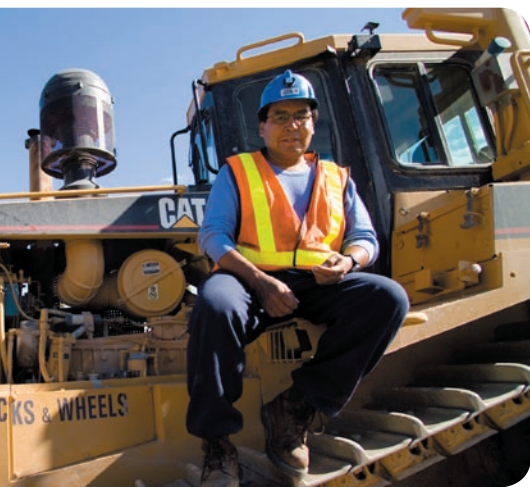
NCN member employed on the Wuskwatim Project.

VARIOUS CULTURAL AWARENESS AND RETENTION SUPPORT PROGRAMS ARE AIMED AT KEEPING NORTHERN AND ABORIGINAL WORKERS EMPLOYED ON THE PROJECT.